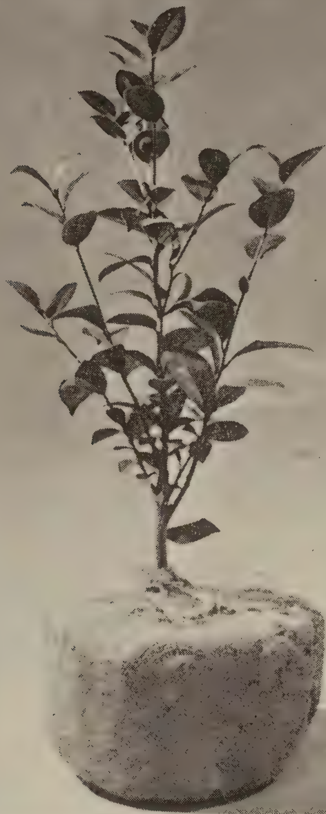
12-18 inch, Branched Camellia B&B